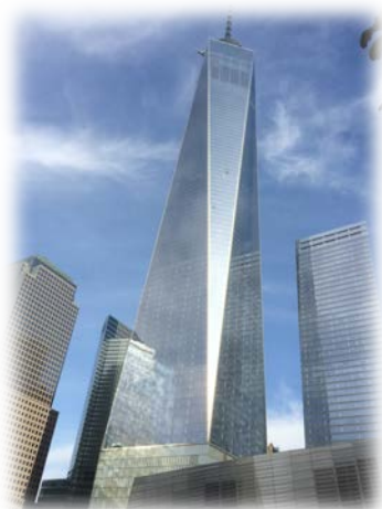
One World Trade Centre