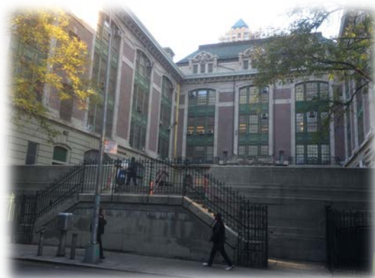
Primary School West 47 th St, Manhattan

children who are so familiar with this sort of learning environment would find the open spaces and somewhat isolation here at Wallabadah just as difficult to deal with. An example that children learn in so many different ways.