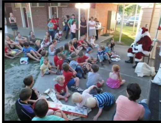
P&C Christmas Tree